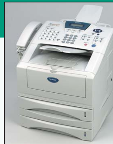
Shown with optional 2nd paper tray.

Adding images to your work has never been quicker or easier. Now, you can scan photos, images, and documents at resolutions up to 9600 dpi. ScanSoft® PaperPort® and OmniPage® OCR software are included for Windows® and Presto!®PageManager® for Mac®. Scanning features include "Scan to File," "Scan to E-mail," or "Scan to OCR."