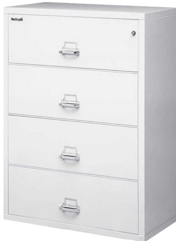
4-3822-C: Four-Drawer 38" Lateral File

Like all FireKing files, these carry FireKing's exclusive 3-Year Warranty on all parts. And our Free Replacement Guarantee: if your FireKing file ever has to protect your records in a fire and any damage occurs to its fire-protection abilities, we'll give you a new one free of charge.